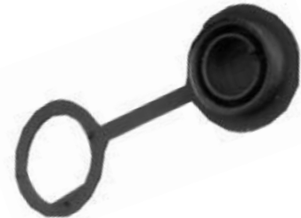
Dust Cap 6295